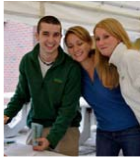
Registration Sponsor Gorham Savings Bank provided the event with a crew of dedicated staffers to handle check in/check out duties.